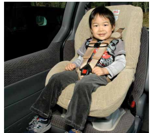
Child seat installed forward-facing